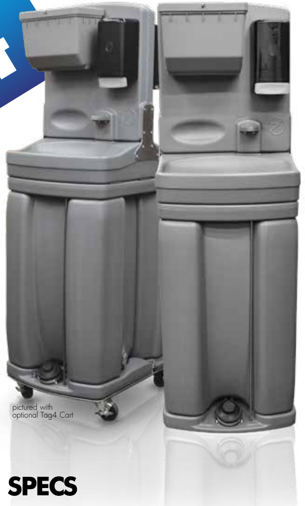
pictured with optional Tag4 Cart